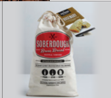
Brew Bread Mix Rosemary Product # K8272 • Size 12/ 15.5 oz.

This is the mix that started it all. A comfort bread. The Classic packs the perfect balance of contrast between sweet and salty. A moist, dense texture to enjoy with any meal. Have fun baking this bread with any variety of beer you desire. A great way to start with a clean slate to really highlight the beer with endless craft beer options.