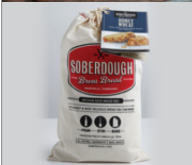
Brew Bread Mix Honey Wheat Product # K8814 • Size 12/ 15.5 oz.

The perfect blend of wholesome wheat, oats, and sweetened with a touch of honey. This hearty bread is loaded with flavor... not your ordinary wheat bread! Excellent toasting bread. The natural fit is a basic pilsner but can also be great with American wheat ales, brown ales, hard ciders or saisons.