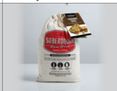
Brew Bread Mix Cinnamon Swirl Product # K8432 • Size 12/ 15.5 oz.

Every bite is packed with real apples! The sweet apple flavor throughout mixed with cinnamon and brown sugar is delectable. This one is a serious bread for every foodie's desire and works well with a Pilsner, Brown or Pale Ales boost the flavor with an apple cider.