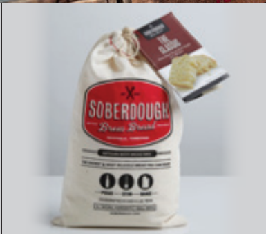
Brew Bread Mix Classic White Product # K8426 • Size 12/ 15.5 oz.

The perfect blend of wholesome wheat, oats, and sweetened with a touch of honey. This hearty bread is loaded with flavor... not your ordinary wheat bread! Excellent toasting bread. The natural fit is a basic pilsner but can also be great with American wheat ales, brown ales, hard ciders or saisons.