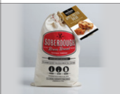
Brew Bread Mix Apple Fritter Product # K8828 • Size 12/ 15.5 oz.

This bread with its fragrant roasted garlic and herbs makes for an incredible bite. Perfect for any meal and dipping in olive oil. Works well with Pale ales and American Lagers, try a hoppy IPA to lend contrast to the rich garlic flavor.