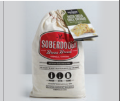
Brew Bread Mix Hatch Chili Cheddar Product # K8808 • Size 12/ 15.5 oz.

A particular favorite, Rosemary blends herbs and fresh cracked pepper for a whirlwind of flavor. This bread will be a wonderful complement to your favorite Italian dish, or a great bread to snack on with some olive oil. Take your taste buds on a tour of the Italian countryside with Rosemary. This mix compliments beers like citrus pale ales, American lagers or hefeweizen well.