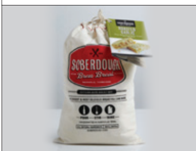
Brew Bread Mix Roasted Garlic Product # K8800 • Size 12/ 15.5 oz.

We use hatch green chiles all the way from New Mexico. This bread is not spicy. We add the chiles for flavor without the heat... a perfect balance of savory spice (not too much) and cheese. Works well with Pale Ales and American Lagers, or add some depth with a Negra Modelo.